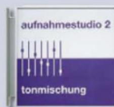
Fahnschild flag mounting sign