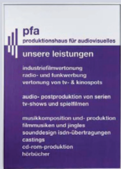
Hauptwegweiser main direction sign