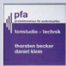
Türschild door sign