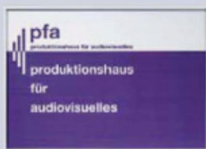
Etagenwegweiser floor direction sign