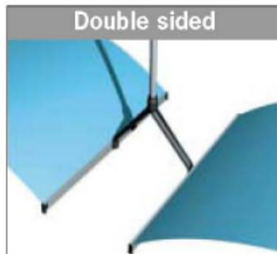
Double sided display uses 2 rail supports on bottom instead of base, as well as 2 rail supports on top.