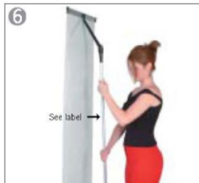
6 Raise top section of pole to apply tension, twist anti-clockwise to lock in place (clockwise to unlock).