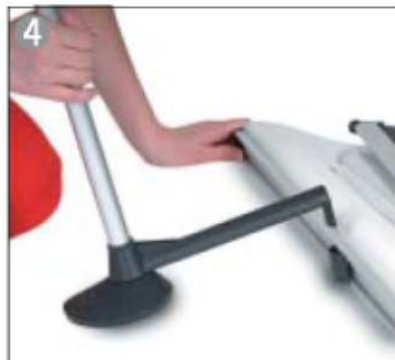
4 Attach bottom rail