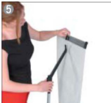
5 Attach top rail