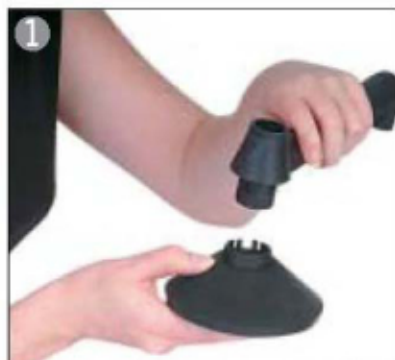
1 Attach bottom rail support to base, opposite the Mark Bric logo