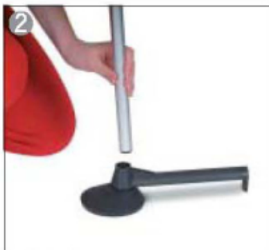
2 Attach pole to base